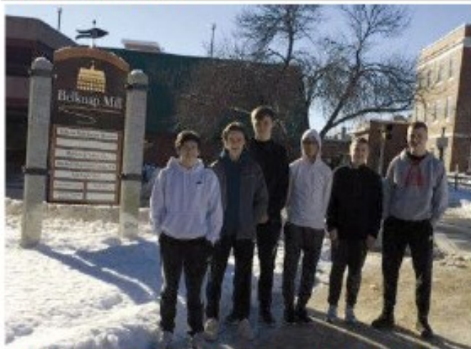
LHS Citizenship Class volunteers at the Belknap Mill Read the full article here .