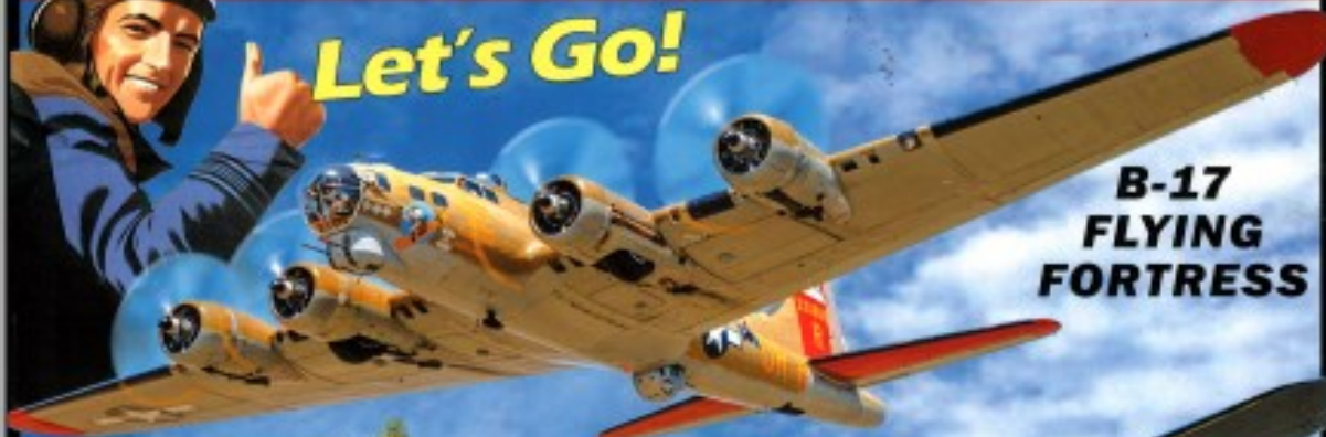
B-17 FLYING FORTRESS