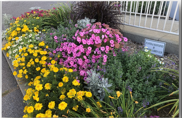
A gorgeous flower bed at the Laconia Post Office