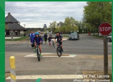
MDW Trail, Laconia